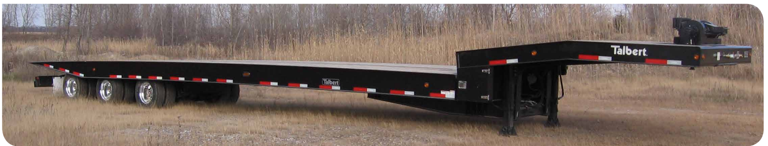
Pictured with optional aluminum wheels.